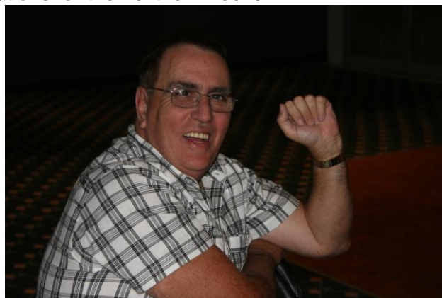
WHO'S GOING TO HELP ME DRINK THE RAFFLE PRIZE